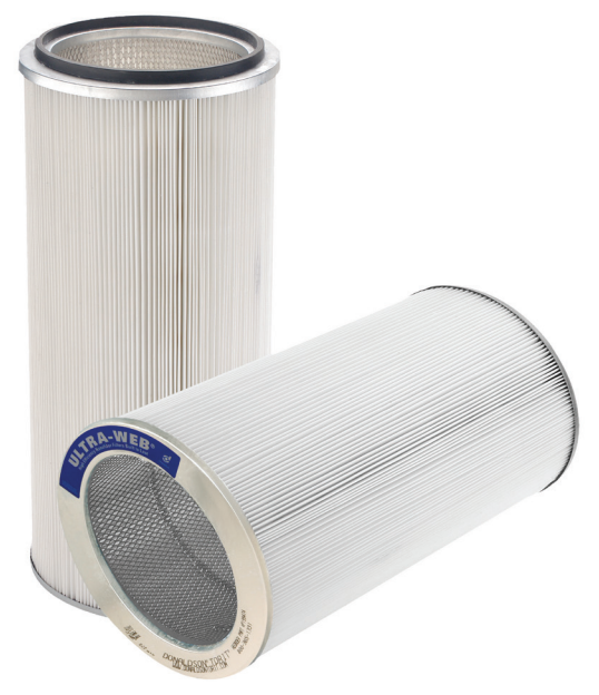
Ultra-Web® SB Cartridge