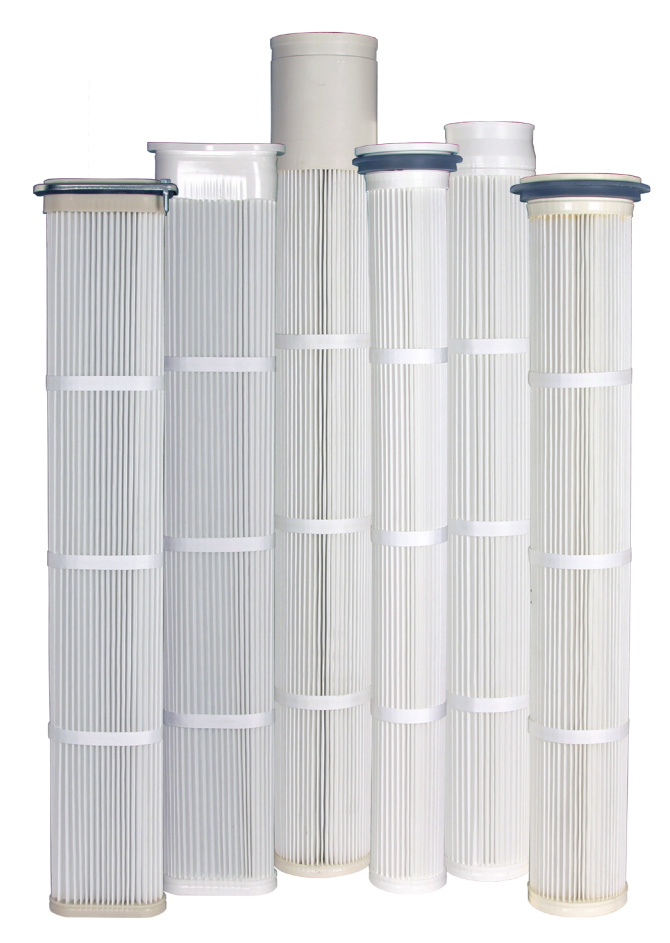
Torit-Tex Pleated Bag Filters