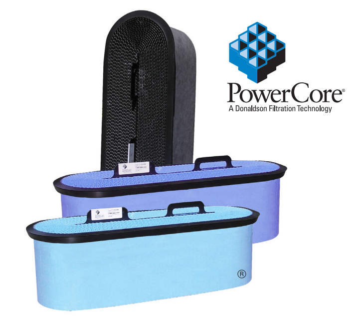
PowerCore® CP Filter Pack (Available in Standard, Spunbond and Anti-Static)

Proven and proprietary Ultra-Web<sup>®</sup> filter media delivers longer filter life, cleaner air and greater cost savings than other traditional filter media. It is made with an electrospinning process that produces a very fine, continuous, resilient fiber of 0.2-0.3 microns in diameter.