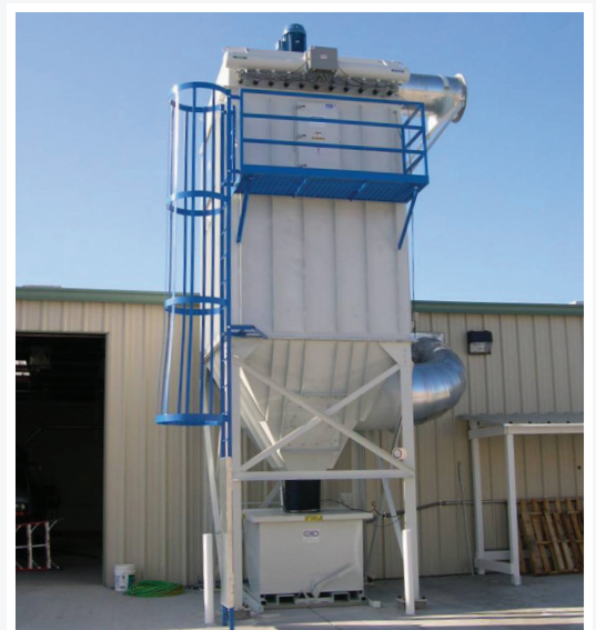
FS - Wood