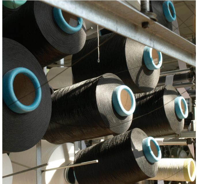
Ultra-Web SB pleated bag filters maintain lower pressure drop across the baghouse in the Karastan rug factory, helping to save energy and keep production running smoothly.

Karastan plant engineer says, "I am thrilled with the performance of the Ultra-Web SB pleated bags! They kept us from having to buy a new collector. So far, we are getting twice the life compared to the old bags, and I suspect we will get even more."