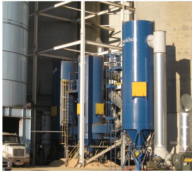
RF - Grain Terminal