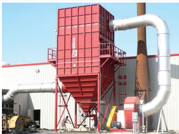
MB - Glass