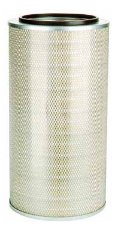
Cellulex <sup>™</sup> Cartridge