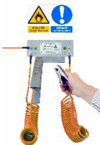
ATEX/FM approved static grounding clamps with grounding station

The Bond-Rite® REMOTE is a wall mounted static grounding device which encourages the operator to ground the equipment before the process starts. The ground loop monitoring system ensures a positive connection resistance of 10 ohms or less. Pulsing green LED indicators inform the operator with a simple GO/NO GO instruction that the process is ok to start.