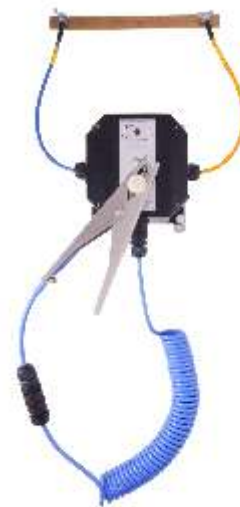
Bond-Rite® REMOTE - Continuous Ground Loop Monitoring with visual indication.