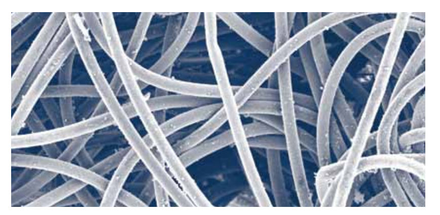
Dura-Life Bag Clean Air Side (300x)

These photos were taken with a scanning electron microscope of bag media used in a collector that was filtering fly ash. The bags were removed after 2,700 hours of use. Air-to-media ratio was 4.5 to 1. Pressure drop after 2700 hours of operation was 6 in. (152.4 mm) on polyester bags and 2 in. (50.8 mm) on Dura-Life.