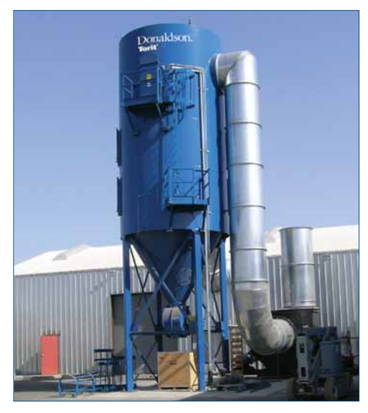
The Dura-Life bag filters in this Donaldson Torit RF Baghouse collector provide longer life and lower emissions at this Midwestern soybean processing plant.

Longer filter life AND lower emissions? Now that's tackling protein dust with muscle.