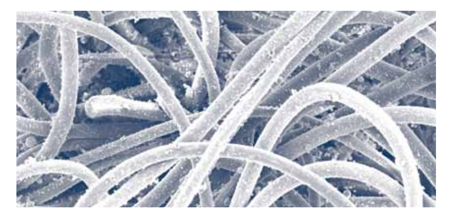
Needled Polyester Bag Clean Air Side (300x)