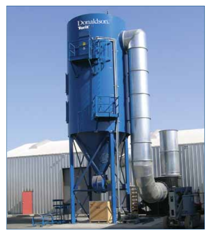
The Dura-Life bag filters in this Donaldson Torit RF Baghouse collector provide longer life and lower emissions at this Midwestern soybean processing plant.

Longer filter life AND lower emissions? Now that's tackling protein dust with muscle.