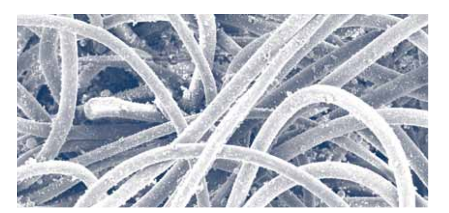
Needled Polyester Bag Clean Air Side (300x)